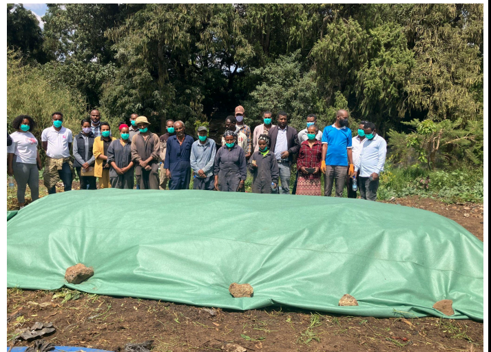
Figure 1: Practical composting skills workshop conducted in Addis Ababa

In Addis, 74.42% of total solid waste is organic . Its diversion relies on collaborative action between the city's cleansing agency and SMEs engaged in compost production. However these small enterprises are facing challenges such as limited technical knowledge and capacity to produce quality compost, access to sorted waste raw material and transportation to composting sites. Through UCAP CAI, a support package was developed to scale up organic waste diversion by building awareness and strengthening SME capacity to produce high quality compost and improve the compost value chain in the city. Through the programme, 26 compost-producing SMEs, 71 SME members (60% were female) and 91 government experts were trained, increasing compost production by up to 5x in some areas.